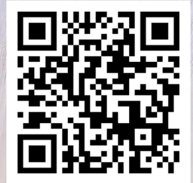
Scan to Nominate

Winners will be honored on Thursday, May 1 during a special event at Teresa's Restaurant in Ware.